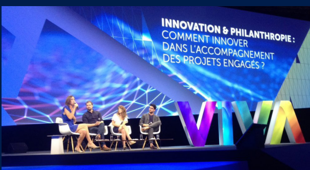
June 17, 2017 - Launching of ShareIT on VivaTechnology.

Why STATION F ? For 35 years, Ashoka has been working to break traditional silos between organisations and encourage hybrid solutions that combine the strengths of each sector (social, public, business...) to design solutions that can address major social issues at scale. By joining STATION F, the world's biggest start-up campus, Ashoka wants to demonstrate that a part of the solutions to global issues lies in the skills and knowledge produced and developed by tech startups. The 1000 startups of Station F could all become social enterprises : ShareIT wants to reveal the social potential of each of them, creating synergies with the most innovative social entrepreneurs.