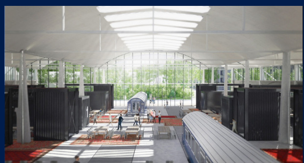
July 4, 2017 - Installation of ShareIT in Station F.